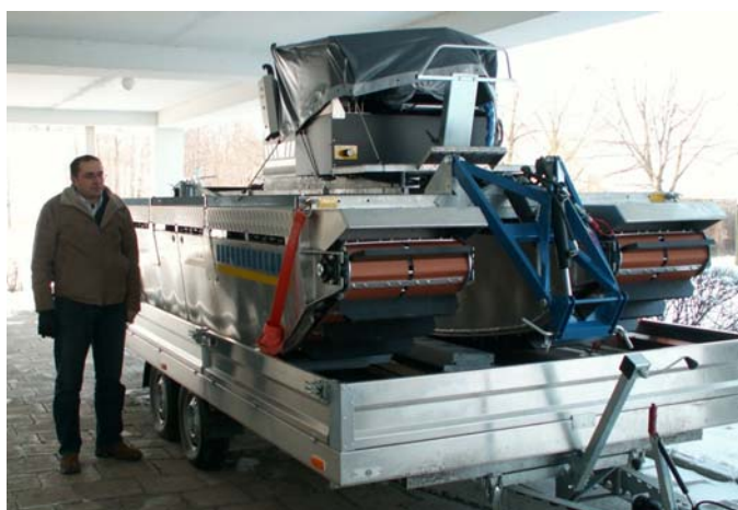
Figure 1: The track-laying mowing vehicle purchased by ZBR.

In timetable scheduled to summer 2005 until autumn 2009, deadline for purchase of terrestrial management equipment is 30.03.2006 and deadline for 50% of foraging habitats managed is 30.06.2007. In progress.